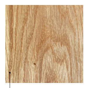
3 coats of harwax oil